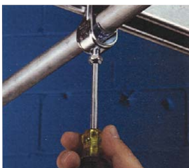
2. Tighten bolt.