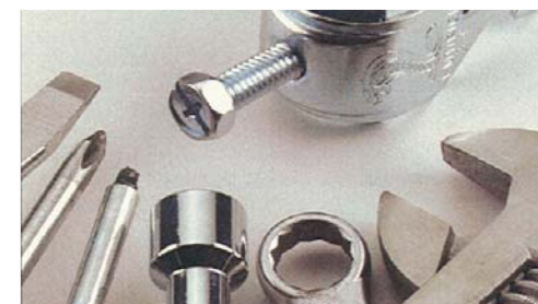
Multi-driver combination bolt head accepts a wrench, screwdriver or nut driver.