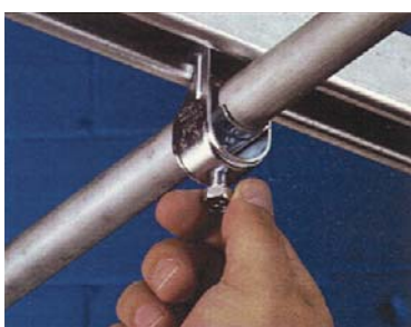
1. Hook clamp into strut channel and hand tighten.