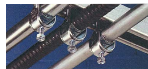
Attaches a full range of EMT, rigid conduit and cable to strut channels.