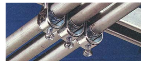
Remove cable or pipes easily without disturbing neighboring clamps.