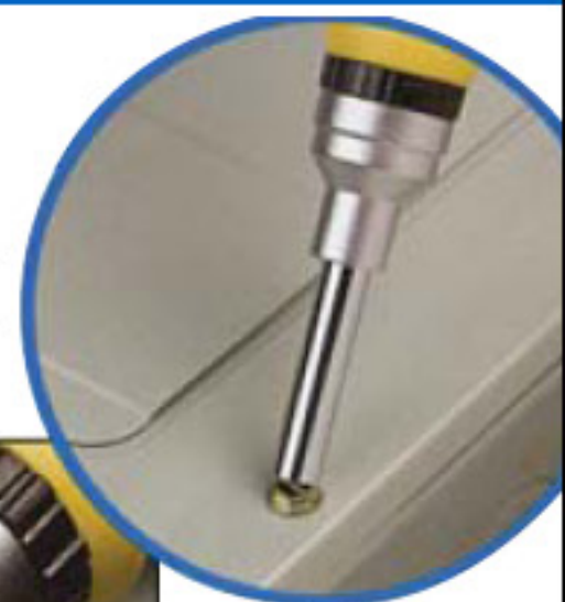
Screwdriver bits remove to reveal nutdriver and nutdriver shaft

The premium three-way ratchet screwdriver mechanism featured in the Ratch-a-Nut™ gives you strength and flexibility you need to finish jobs faster and easier. The unique slip-free ergonomic handle design provides comfort, torque and maximum control, while the textured Santoprene™ grip resists perspiration, water, oil and chemicals.