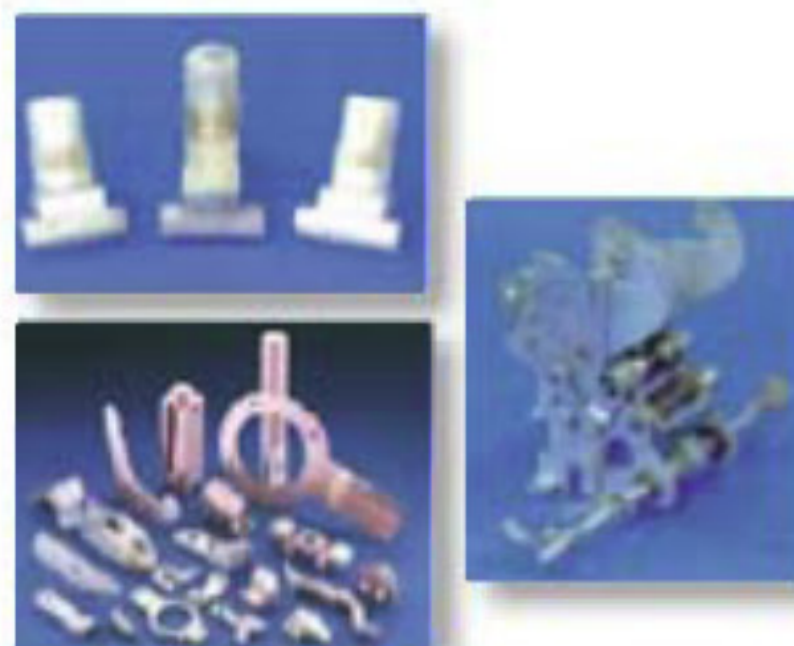
Photos show various components and parts that have been fully cleaned and repaired or re-plated.