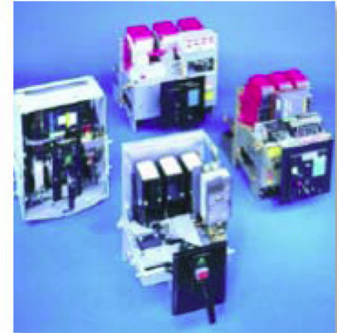
Reconditioned low-voltage circuit breakers from various original equipment manufacturers.