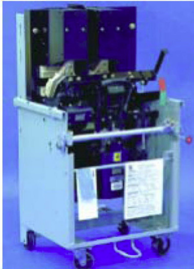
A fully reconditioned power circuit breaker ready to ship back to the customer with full C5 RECONDITIONED certification and test documentation.

MONTEREY 93940 2320 DEL MONTE AVE., #B 831-373-4786 FAX: 831-373-8430