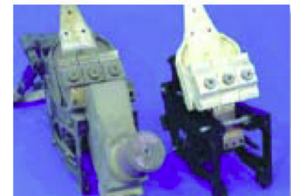
A damaged circuit breaker contact assembly shown on left with fully refurbished contact assembly on the right, after being cleaned and repaired.